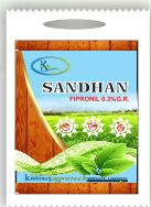
SANDHAN FIPRONIL 0.3% GR