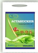
ACTASUCKER ACETAMIPRID 20% SP