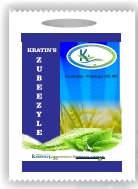
ZUBEEZYLE Clodinafop - Propargyl 15% WP