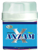
AXZAM Thiamethoxam 25% WG