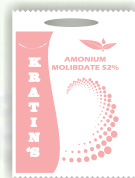
AMONIUM MOLIBDATE 52%