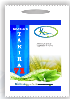
TAKIRA-71 AMONIUM SALT OF GLYPHOSATE 71% SG