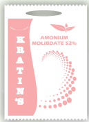
AMONIUM MOLIBDATE 52%