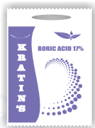
BORIC ACID 17%